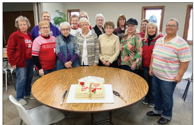
Phi Chapter members celebrate 70 years

(Chapter news continued on the next page)