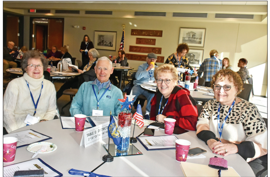
Attendees sat at tables grouped by district.