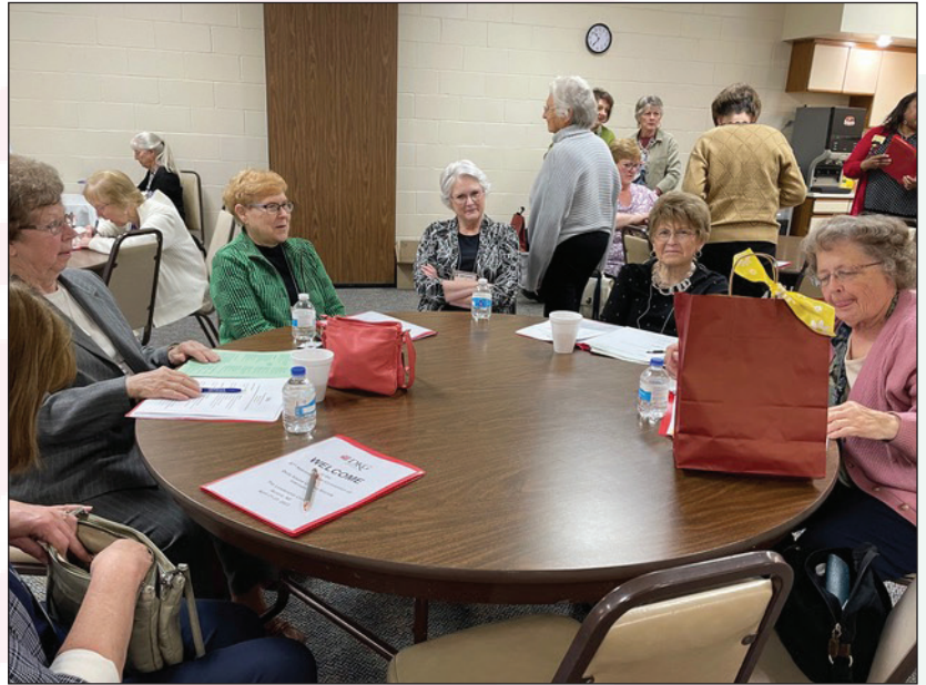
▲ Social time during "Nebraska Night" was perfect for catching up with friends.