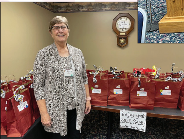
◀ Nu Chapter was in charge of the Hospitality Suite and provided everyone with a marvelous snack bag!