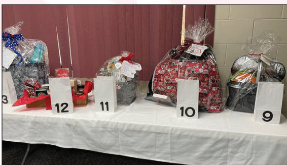
◀ Friday evening was for looking at the wonderful creative baskets and putting in your tickets.