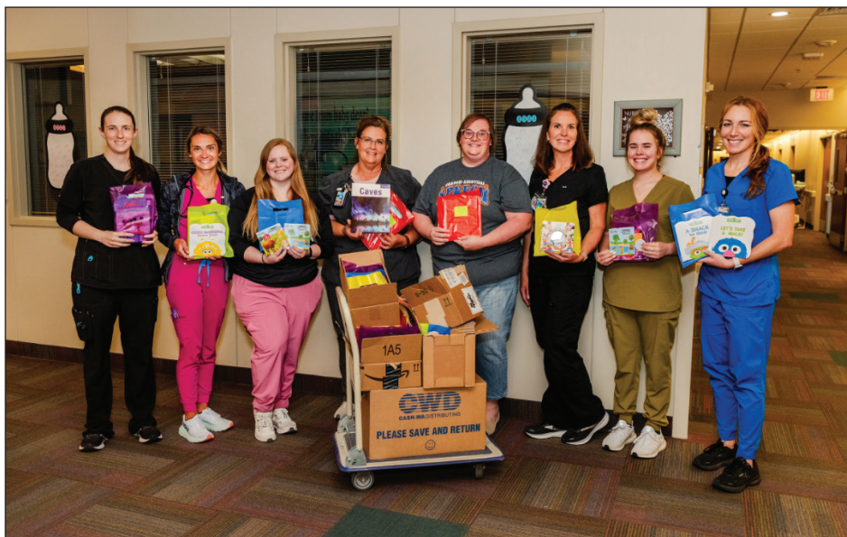
Rho chapter provides two books per child born in Chadron Community Hospital in the Raising Readers program.